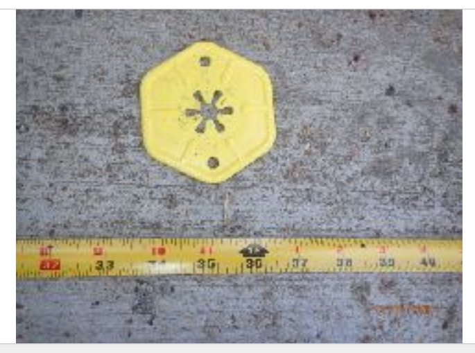
Surface measurements and view of off set and root intrusion