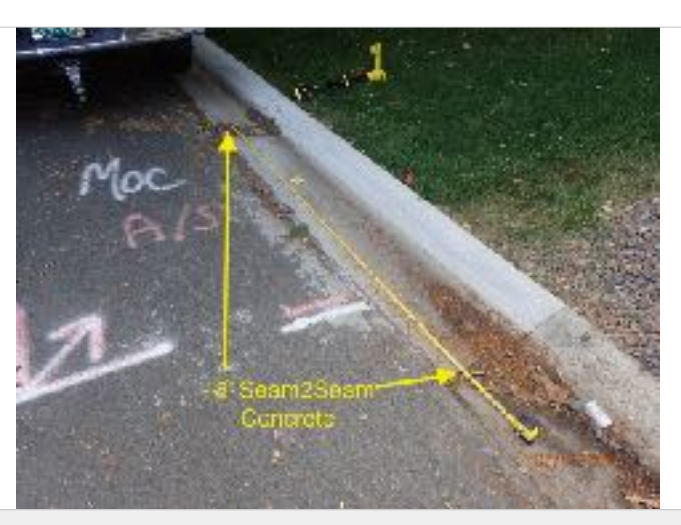
Surface view of off set.