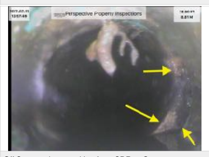
Off Set noted at transition from SDR to Concrete.