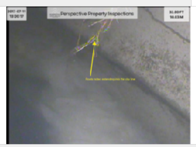
Roots extend into the city sewer line