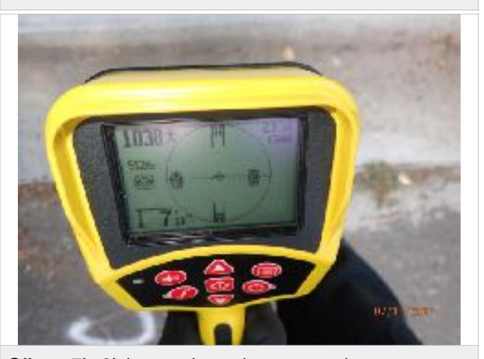
Offset ~7' - 8' deep at the at the storm curb