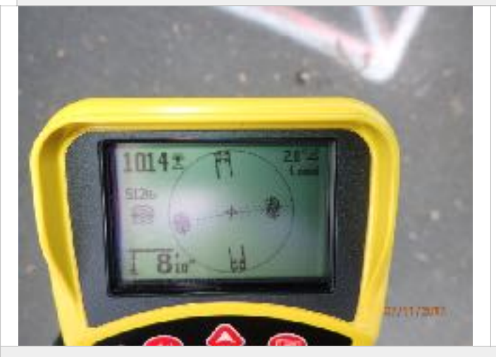
Approximate depth and location of sewer tap. Surface view